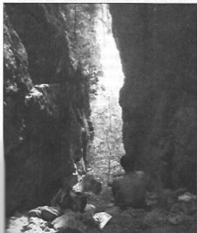
Outdoor recreation can inspire contemplation.

Contemplation is only one form of leisure that Americans came to enjoy, the other forms being recreation and amusement. Although the new settlers of North America had more free time, that free time did not transform into leisure easily. Leisure, as a state of being, was protested vigorously by the strict Calvinists of colonial America. Puritan requirements led the colonists to live without the "mispendence of time," adhering strictly to the observance of the Sabbath. They tolerated no pagan festivities, no licentious plays and spectacles, and no violations of the Sabbath.