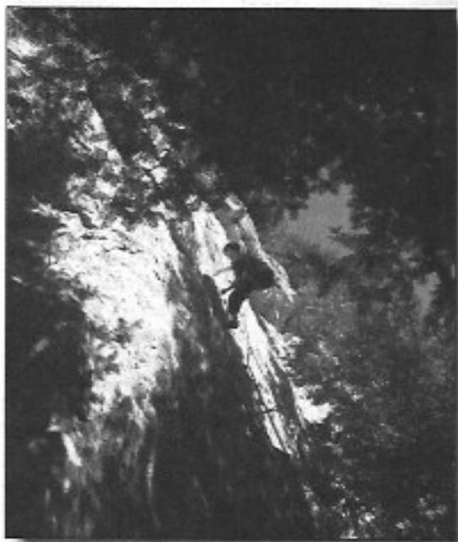
Rock climbing is an excellent form of outdoor recreation that people choose to participate in during free time.

Furthermore, the data revealed that about 94% of the U.S. population participated in some form of outdoor recreation over 1 year. The investigators used the term enthusiasts to describe the men and women who constituted the bulk of participants, accounting for 70% to 89% of participation. It is estimated that 21.4% of enthusiasts were keen on walking, followed by 19.7% who were beachgoers, 17.4% sightseeing fans,